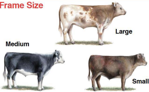
Large and medium frame pictures depict minimum grade requirements. The small frame picture represents an animal typical of the grade.